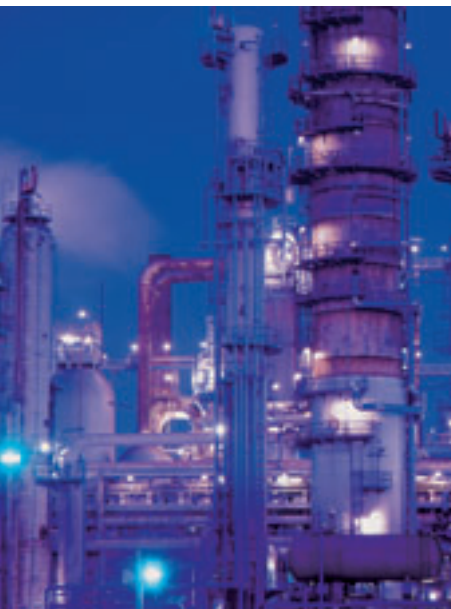
With the safety values calculated in accordance with IEC 61511 and a failure rate of once in 300 years, the SITRANS P DS III is designed for use in plants where safety and reliability are paramount. And since this is our standard device, you pay nothing extra for this feature.

Experience in a number of applications has shown just how well-designed the SITRANS P DS III is for real-life practice. If you want a high level of safety and reliability, you should put DS III at the top of your list.