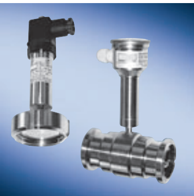
The Compact series

The SITRANS P Compact is an analog transmitter for measuring absolute and gage pressure. It was developed with the special requirements of the food-and-beverage/pharmaceuticals/biotechnology industries in mind. The devices are designed to meet the hygienic recommendations of EHEDG, FDA and GMP. A number of aseptic process connections made of stainless steel and a stainless steel housing (IP67) were included in the Compact series to meet the more stringent hygienic requirements. High surface quality was a special focus, with an option to electropolish the system. Our pressure measurement specialist "Compact" complements its cleaning and sterilization process (CIP, SIP) with no-drift, error-free functionality.