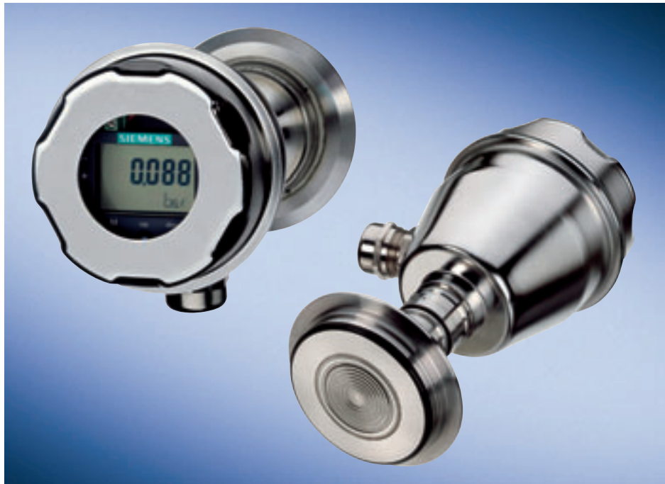
The P300 series

It is also worth mentioning the optional extended temperature range up to 392 °F/ 200 °C, which allows the transmitters to be used in applications for which remote seals had to be used in the past. This is where the SITRANS P300 stands out thanks to its increased accuracy of measurement and shorter delivery times as compared to remote seals.