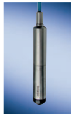
The MPS series

The SITRANS P, MPS series is a transmitter for hydrostatic level measurement. It's dipped into the medium hanging at the end of a cable. The sensor's stainless steel housing makes it suitable for use in everything from drinking water to aggressive liquids.