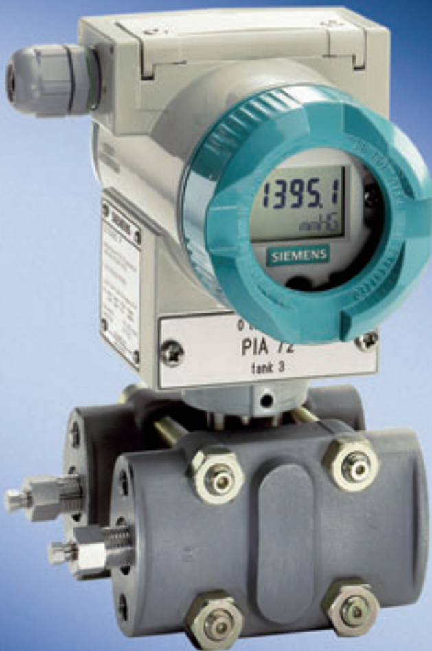
The DS III series