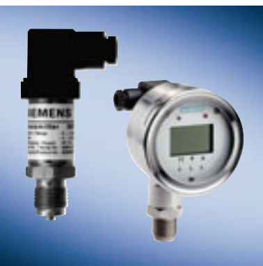
The Z and ZD series

In the Z series, we use two types of diaphragm materials: stainless steel or ceramic. That makes measuring process pressure, absolute pressure and hydrostatic pressure a breeze. You can set the pressure measured with these sensors to be transformed into either a 4–20 mA or 0–10 V signal.